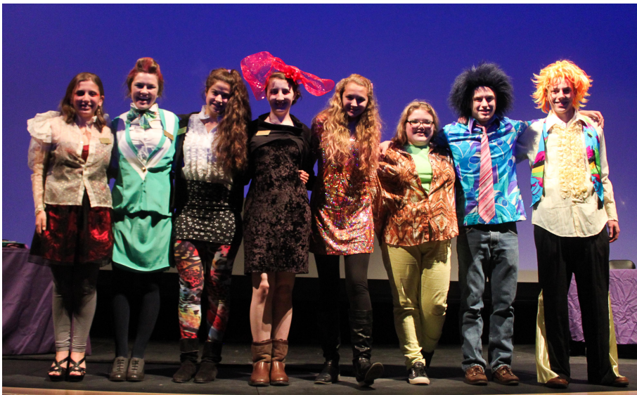
Maine Junior Classical League officers posing in their Hunger Games attire at the Fall Convention on November 22<sup>nd</sup>.