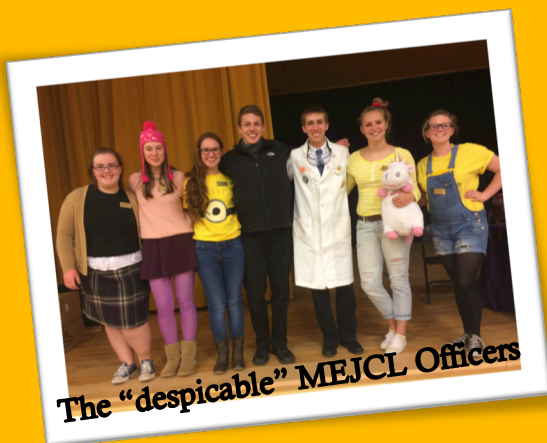
The "despicable" MEJCL Officers